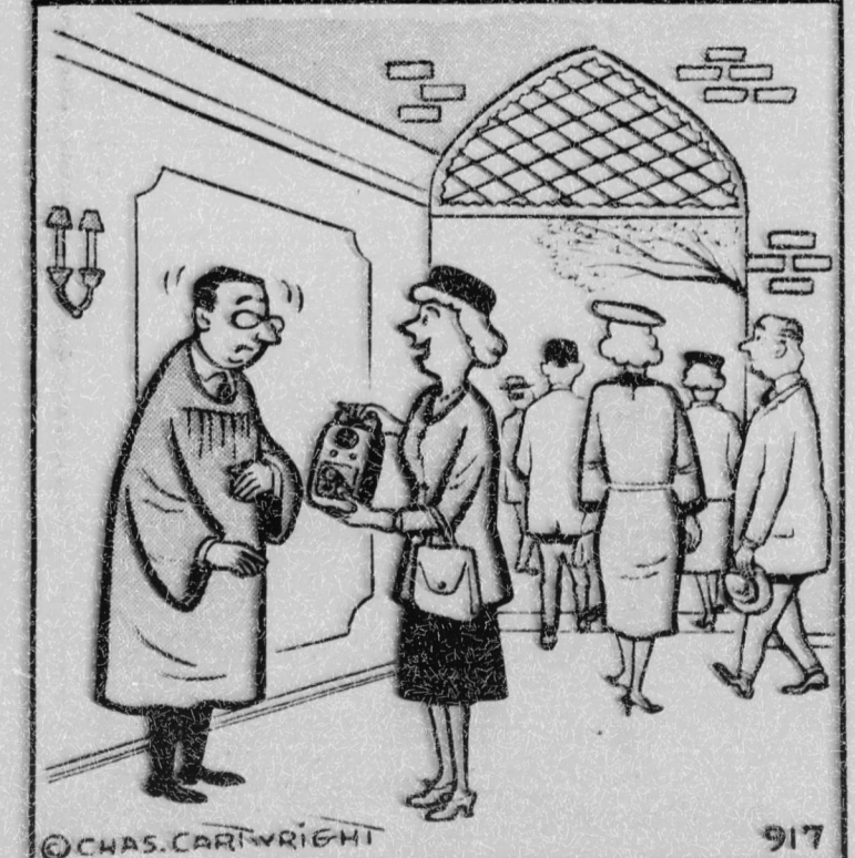
"You're making quite an impression on my husband. He bought me this tape recorder so he can hear your sermons after his Sunday golf match!"