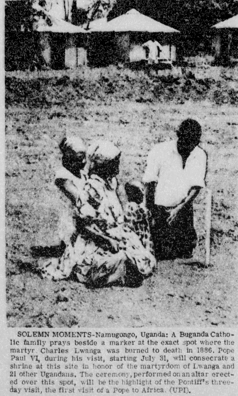
SOLEMN MOMENTS-Namugongo, Uganda: A Buganda Catholic family prays beside a marker at the exact spot where the martyr Charles Lwanga was burned to death in 1886. Pope Paul VI, during his visit, starting July 31, will consecrate a shrine at this site in honor of the martyrdom of Lwanga and 21 other Ugandans. The ceremony, performed on an altar erected over this spot, will be the highlight of the Pontiff's three-day visit, the first visit of a Pope to Africa.