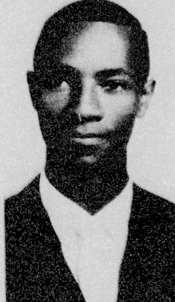
GETS FULL NCC SCHOLARSHIP