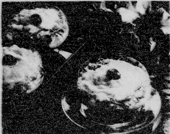
LUAU PUDDING (Makes 6 servings)

Delight youngsters and oldsters alike with tasty Luau Pudding. This delicious warm-weather dessert is made with ingredients you keep on hand. The pudding features velvety evaporated milk, the milk for all your cooking needs. Serve Luau Pudding . . . a real treat.