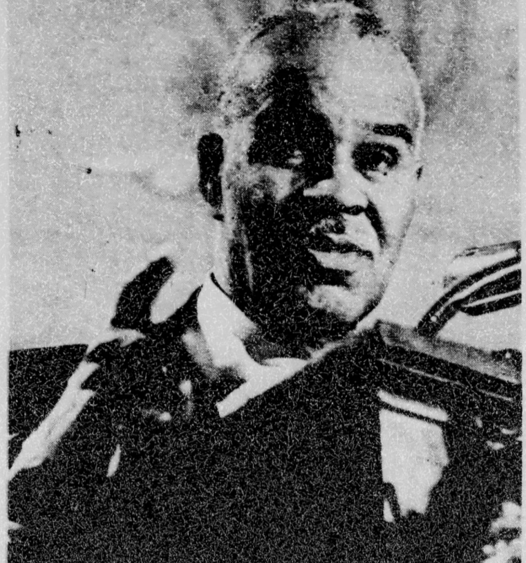
MAKES POINT - Jackson, Miss.: Roy Wilkins, Executive Director of the National Association for the Advancement of Colored People, makes a point here June 29 during a news conference. Wilkins is in Jackson for the 60th anniversary convention of the NAACP which got underway June 30