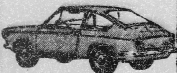
The fabulous FIAT 850 coupé