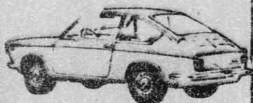
The fabulous FIAT 850 coupé