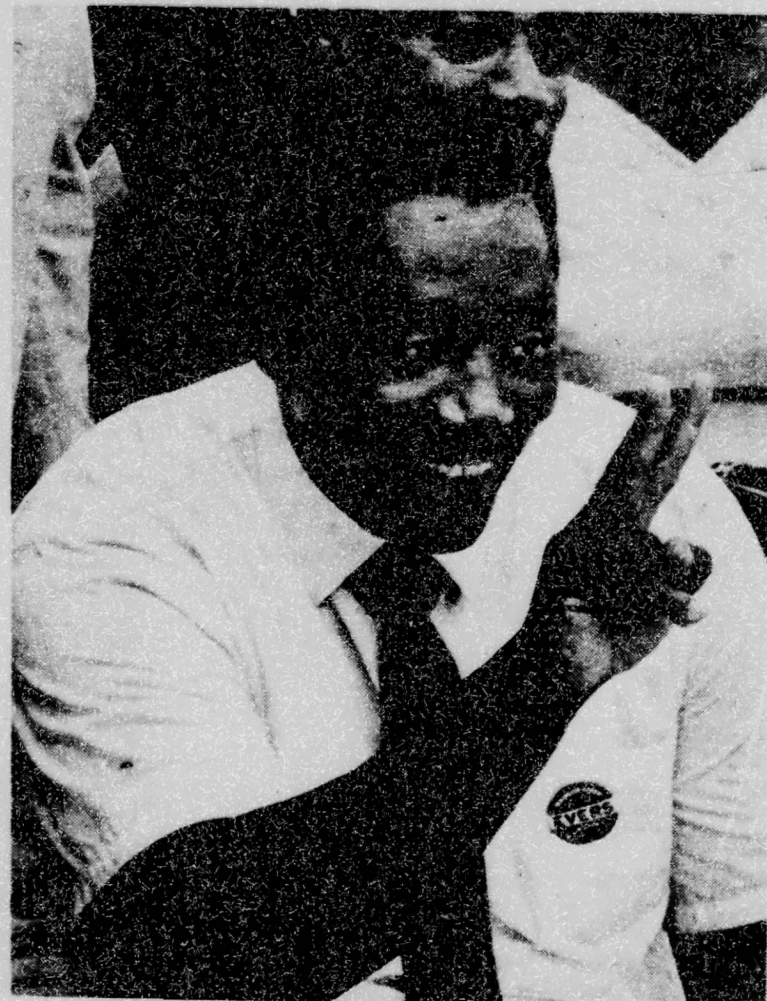
GIVES VICTORY SIGN - Fayette, Miss.: James Charles Evers, 46, the first black man to become Mayor of a biracial town in Mississippi since reconstruction days, was sworn into office here July 7 in ceremonies at City Hall. Evers, shown, gives the victory sign to a large crowd gathered for the gala affair.