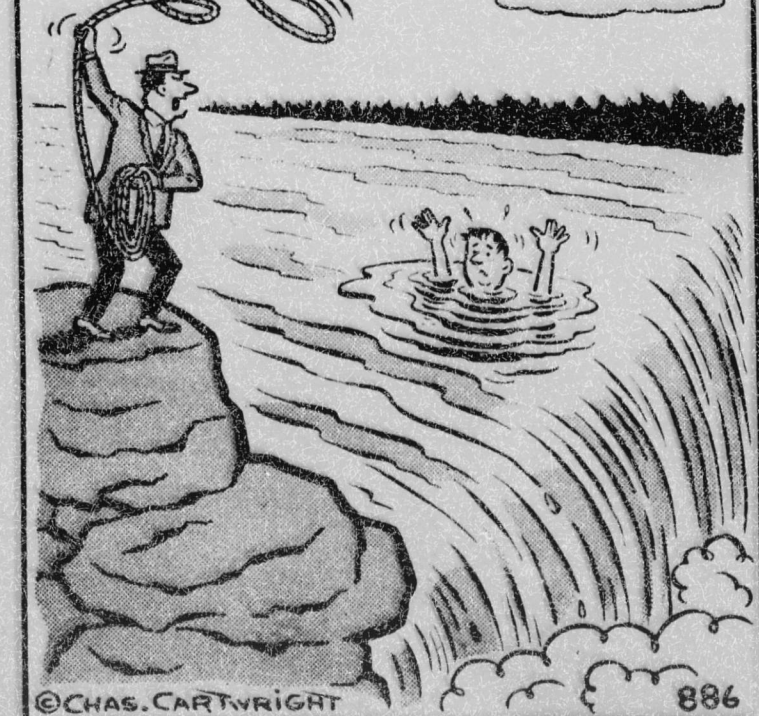
"What denomination are you?"