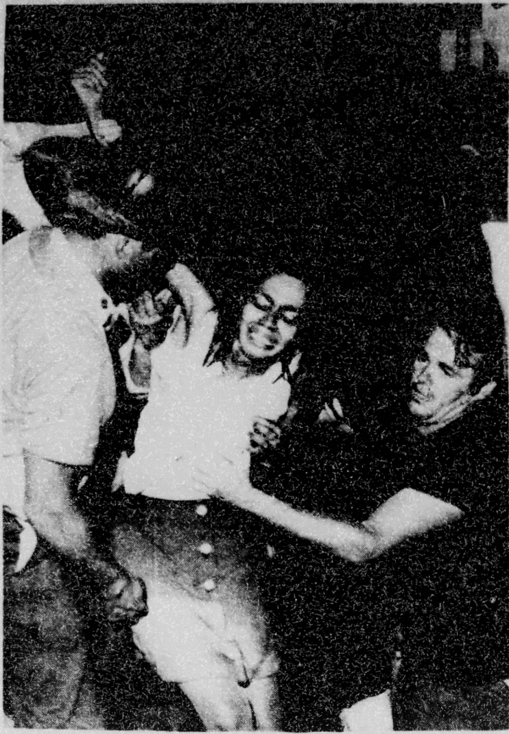
RESCUED PASSENGER HYSTERICAL -New York: Firemen aid an hysterical passenger from an emergency exit after she, along with thousands of others, was trapped in the Lexington Ave. line in Manhattan July 18. One man was killed, and thousands of others were treated at local hospitals for heat exhaustion, minor cuts and bruises, and heart attacks as passengers sought escape from the steaming underground trains. (UPI).