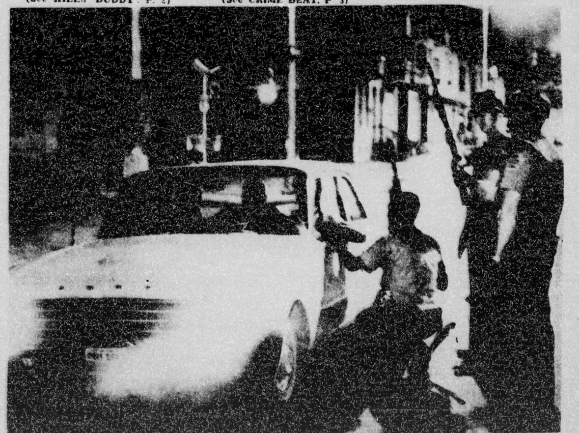
GIVES 'TROUBLE AHEAD' WARNING -York, Pa.: A York City policeman accompanied by two state police, warns motorists of trouble ahead during the fifth straight night of civil disorders in this city. There have been 26 wounded and one killed in the last five days. Many by gunfire from snipers.

Temperatures during the period, Thursday through Monday, will average above normal, except near normal in the extreme western portion of the state. Daytime highs will average in the low 80s in the mountains, and in the high 80s and low 90s elsewhere. Lows at night will be in the low 60s in the mountains and the mid 70s elsewhere. It will be quite warm Thursday, with some moderation in the northwest portion about Sunday. Precipitation will be heavy in the mountains and moderate elsewhere, with one inch or more expected in the mountains and one-half inch in the remainder of the state, occurring as mostly scattered afternoon and evening thundershowers, becoming more numerous toward the end of the week.