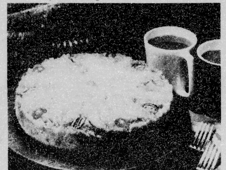
PEACH BRUNCH CAKE (Makes 6 to 8 servings)

Invite the neighbors in for coffee and Peach Brunch Cake. The light, tender cake is made with Velvetic evaporated milk to keep it moist and delicious. Use it for creaming your coffee, too. You will like what it does for your cooking.