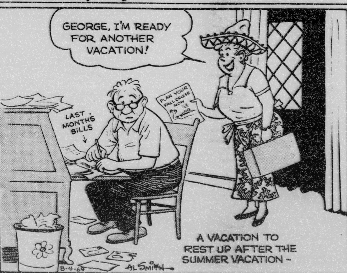
A VACATION TO REST UP AFTER THE SUMMER VACATION -