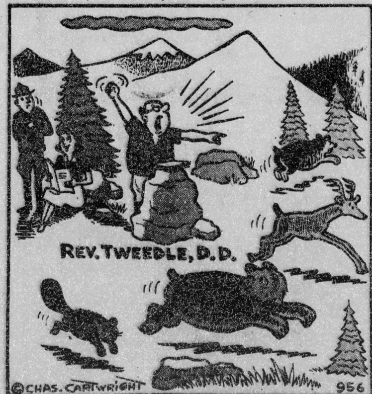
"He's just letting off steam by preaching sermons he didn't dare deliver to his congregation back home!"