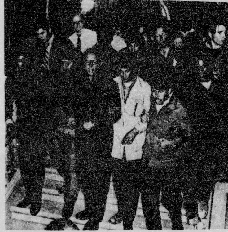
OCCUPY STATE ASSEMBLY BUILDING - Madison, Wis.: Father James Groppi (third from left) leads welfare demonstrators from the state capitol. Some 300 demonstrators occupied the Wisconsin state assembly building for nearly ten hours before leaving peacefully. Governor Warren Knowles earlier had ordered units of the Wisconsin National Guard to the capitol.