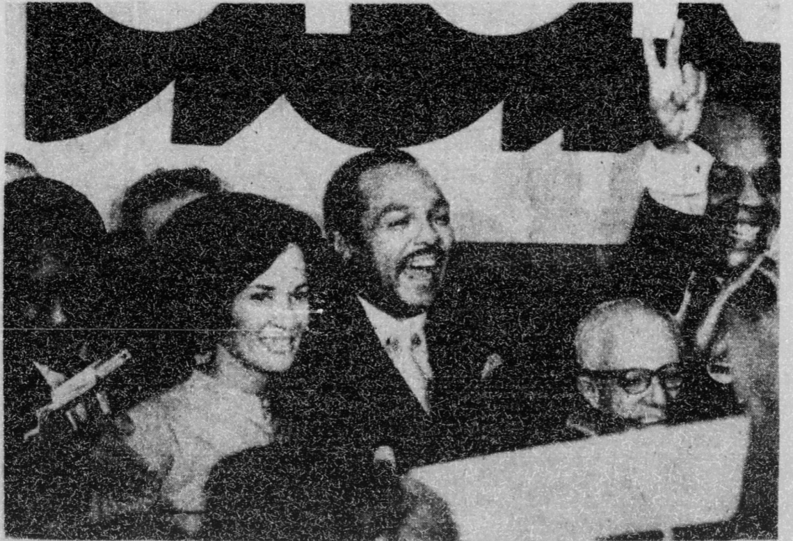
STOKES WINS CLEVELAND PRIMARY - Cleveland: Mayor Carl B. Stokes, first Negro to be elected mayor of a large American city, claims victory in Democratic primary for renomination September 30, Stokes, flanked by wife, Shirley, at left, faces a tougher fight for general election from Republican Ralph Perk.