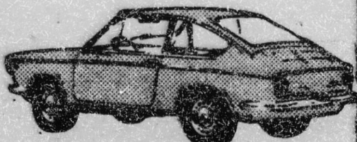
The fabulous FIAT 850 coupé