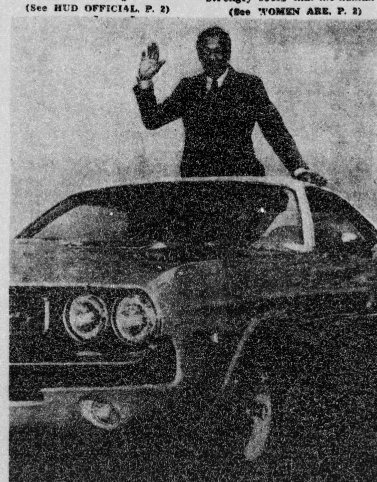
CLENDENON AND NEW CAR-New York: Donn Clendenon heavy-hitting ist baseman of the New York Mets, has a wave and a brand new car presented him by Sport Magazine October 21 for being chosen most valuable player in the World Series.

The major points of concern dealt with the weaknesses in the relocation plan and the exact location of the highway, interchange. The League strongly feels that the human (See NOMEN ARE, P. 2)