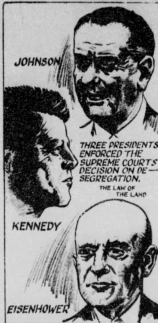
JOHNSON KENNEDY EISENHOWER