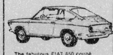
The fabulous FIAT 850 coupé