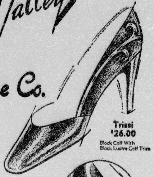
Trisei $26.00 Black Coll With Black Lustré Coll Trim