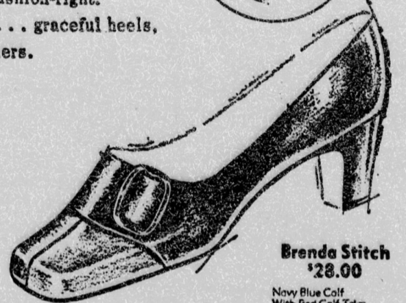
Brenda Stitch $28.00 New Blue Coll With Red Coll Trim

Mail Orders Promptly Filled Add 3% Sales Tax and 60c Parcel Post Charges