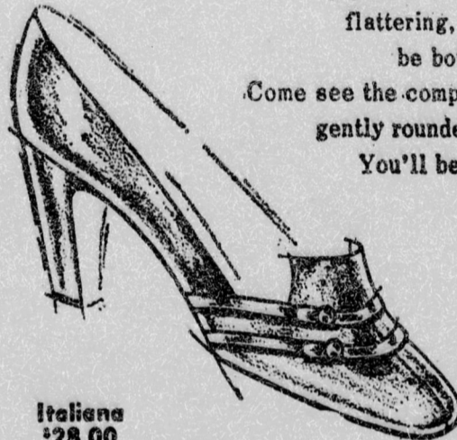
Italiens $28.00 • Chestnut and winter white veneto • Ten Sunken Shadow Coll

Come see the complete collection . . . graceful heels, gently rounded toes, fine leathers. You'll be delighted!