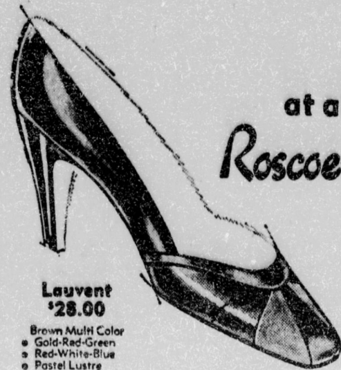
Lauvent $28.00 Brown Multi Color • Gold-Red-Green • Red-White-Blue • Pointe Lustré Coll '30