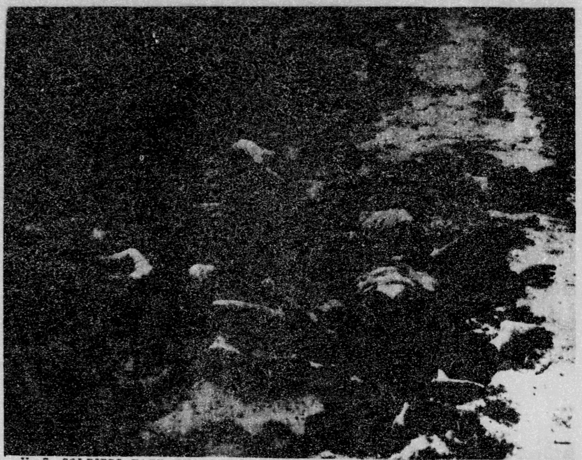
U. S. SOLDIERS FACE CHARGES IN THESE DEATHS--SONG MY, S. Vietnam: The bodies of villagers in this Hamlet are shown shortly after they were shot to death, reportedly by American troops on March 1, 1968. This photo was taken by an ex-Army Sergeant. The dead are claimed to be victims of an alleged massacre of a Division of the U. S. Army. Most of the victims are women, old men and very young children.

The local Raleigh-Wake League of Women Voters will sponsor a general session, centered around "North Carolina Public Assistance -- Priorities for Progress." The meeting is slated for Wednesday, December 10, at 8:00 p.m. at the Richard B. Harrison Library, New Bern Avenue. (See VOTERS TO, P. 2)