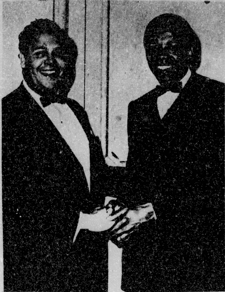
"YOUNG MEN OF THE YEAR"—Attorney Maynard Jackson newly elected Vice Mayor of Atlanta, and 1969 World Series Most Valuable Player, Donn Clendenon exchange congratulations after Jackson was named "Young Man Of The Year" and Clendenon was named "Young Man Of The Year" in Professions, at the annual Omega Chapter of Y's Men's Club International 1969 Awards Banquet. Clendenon, runner-up to Jackson's Award, was the featured speaker. He is Vice President at Scripto, Inc., and owner of Donn Clendenon's Supper Club in Atlanta.