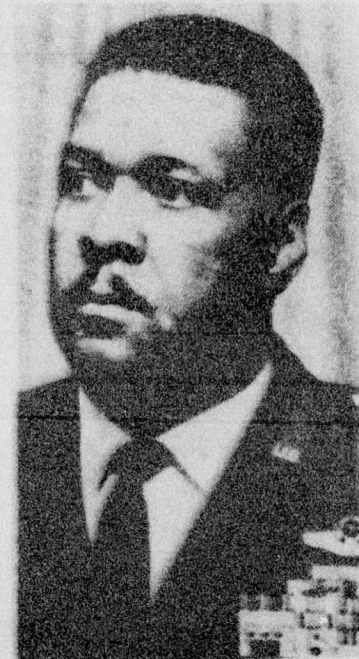
DEPUTY DEFENSE SECRETARY—Washington: Air Force Col. Daniel "Chappy" James, Jr., who flew 78 combat missions in Vietnam and then took command of Whelligus Air Base in Lybia is shown as he was introduced to the press at the Pentagon after being named deputy assistant secretary of defense for public affairs February 3. Col. James is the first Negro and first military man to hold the post. He is being promoted to brigadier general and will assume his new duties next month.