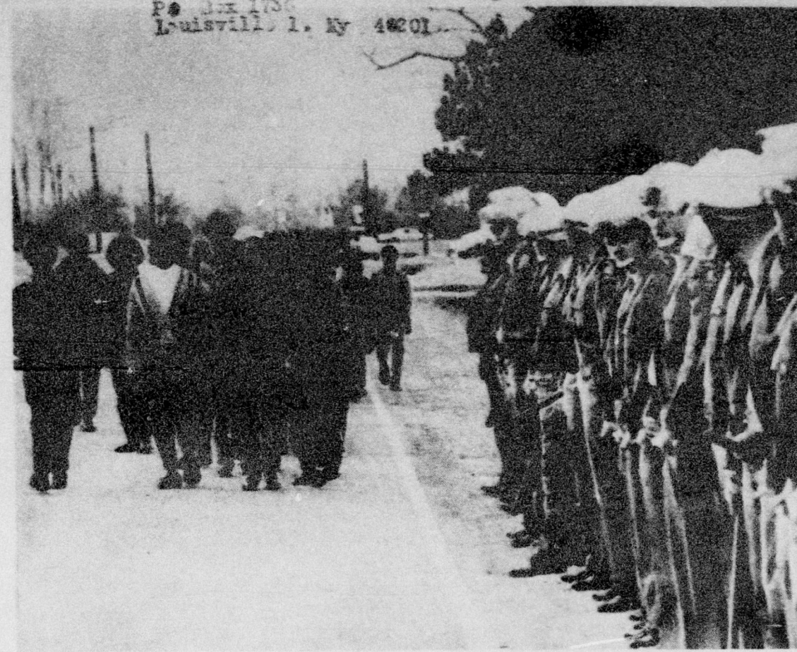
CONFRONTATION - Sandersville, Ga.: Civil rights demonstrators march past helmeted Georgia highway patrolmen, in another series of marches to protest that black demands in Sandersville are not being met. The demonstrators attempted to meet with Governor Lester Maddox, but when told only two of their group could meet with the Governor, they refused and marched back to their homes.

"This is needed not only to remedy the ills of the past but to provide the skilled workers the nation must have for the future. Only in this way can the entire nation be mobilized for a total assault on bias in the building trades and, at the same time, create a fully-in-