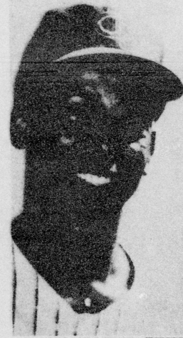
BANKS' LIFE THREATENED -Scottsdale, Ariz.: The Chicago Cubs reported February 27 the life of their star first baseman, Ernie Banks (shown in 1969 filer) had been threatened by an anonymous telephone caller and the club said precautions were being taken to protect the veteran player.

The busy March card will close on campus, at Howard March 31, in a triangular engagement with Virginia Union and Norfolk State University. With seven engagements, April will be the busiest month of the spring. Bison-wise--with the usual conference and NCAA championships on docket for May and early June.