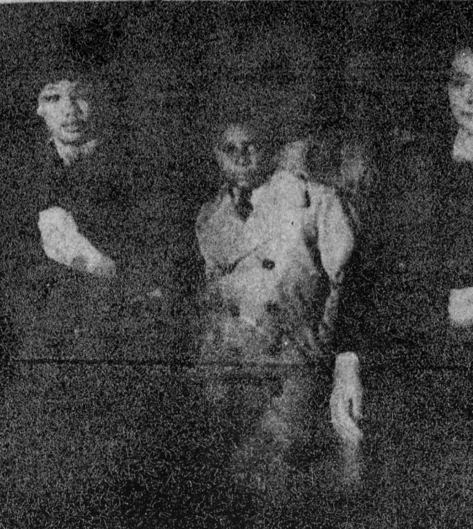
VIEW FILM ON HUSBAND, FATHER—Atlanta: The family of the late Dr. Martin Luther King arrives at a downtown Atlanta theater March 24 for the showing of the film documentary of the slain civil rights leader. (L-R) Yolanda, 14; Martin, 12; Mrs. King and Dexter, 9. Daughter Bernice not shown.

The deadline for submitting colored pictures is noon on Monday, March 30.