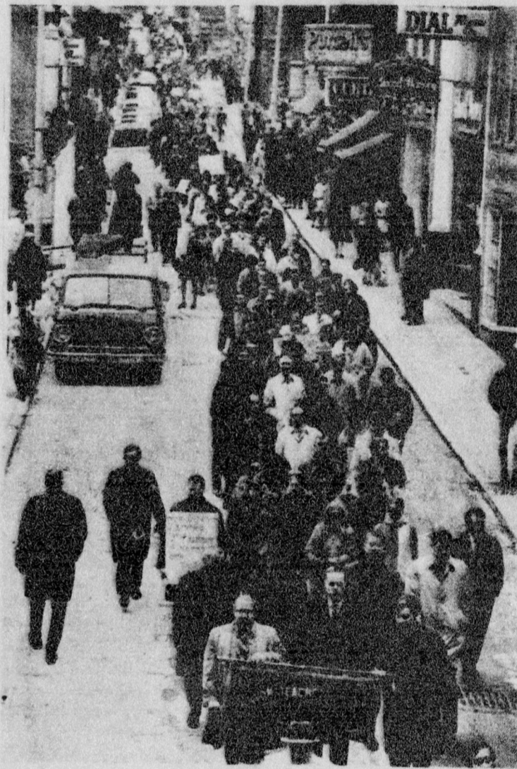
4,500 TEACHERS STRIKE—Boston: A work stoppage by most of Boston's 4,500 teachers forced the closing of the city's 197 public schools March 24. The members of the Boston Teachers Union staged what they called a "Professional" day and set up pickets at several schools. Several hundred are shown as they marched down School Street from School Headquarters to Boston City Hall.