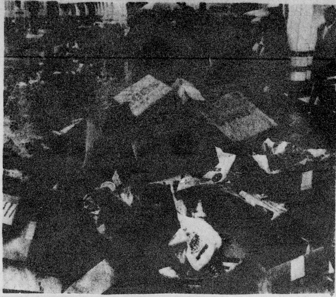
GARBAGE PILING UP-Atlanta, Ga.: This was the scene in downtown Atlanta March 21 as the garbage continued to pile up due to the strike of 1600 municipal workers. Mayor Sam Massell said March 21 that the city personnel department will accept applications to replace the striking workers. (UPI).