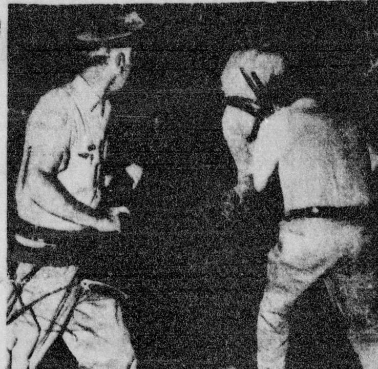
SEARCH FOR ESCAPED PRISONERS-Scotland Neck: Department of Corrections prison guards search through a heavily wooded swamp area for 13 inmates still on the loose following their June 9 escape from a prison bus. The prisoners escaped when the bus carrying them stopped at an intersection and several of the inmates broke through a door separating them from the guards and overpowered them.

The controversial Southside urban renewal plan took on a new shape Tuesday afternoon as the City Council approved a revised edition of the plan, scaled down from 113 acres to 98 acres. This new plan is 20 acres smaller than the original plan approved by voters in the March referendum.