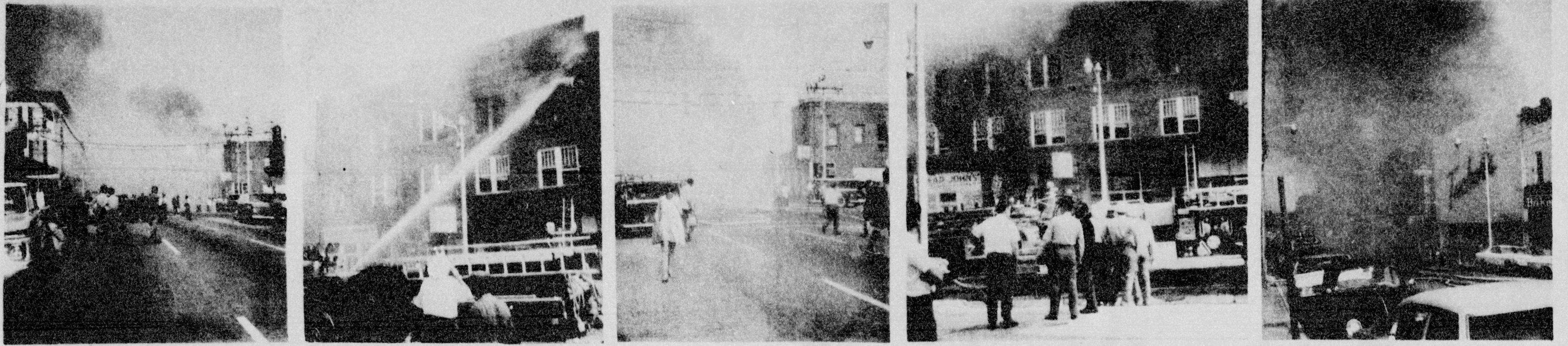
SCENES FROM PEEBLES' HOTEL FIRE—Shown above are scenes, taken from various positions last Wednesday, as the Peebles' Hotel went up in flames. The establishment has been deemed a total loss. Photo at far left was taken a couple of blocks away from the burning hotel. In the next picture, the