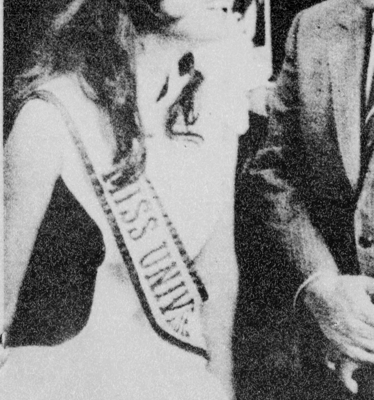
"MISS UNIVERSE" GREET'S NEWARK'S MAYOR-Newark, N. J.: Miss Universe, Marisol Malaret Contreras of Puerto Rico, meets Kenneth Gibson, recently elected as Newark's first Negro mayor, in his office, July 19. Miss Contreras was in Newark for the annual Puerto Rican Day parade here, July 19.

Sweepstakes numbers valuable this week are: 08612, first prize, worth $25 in trade at Hellig-Levine of Raleigh, corner of S. Wilmington and E. Hargett Sts.