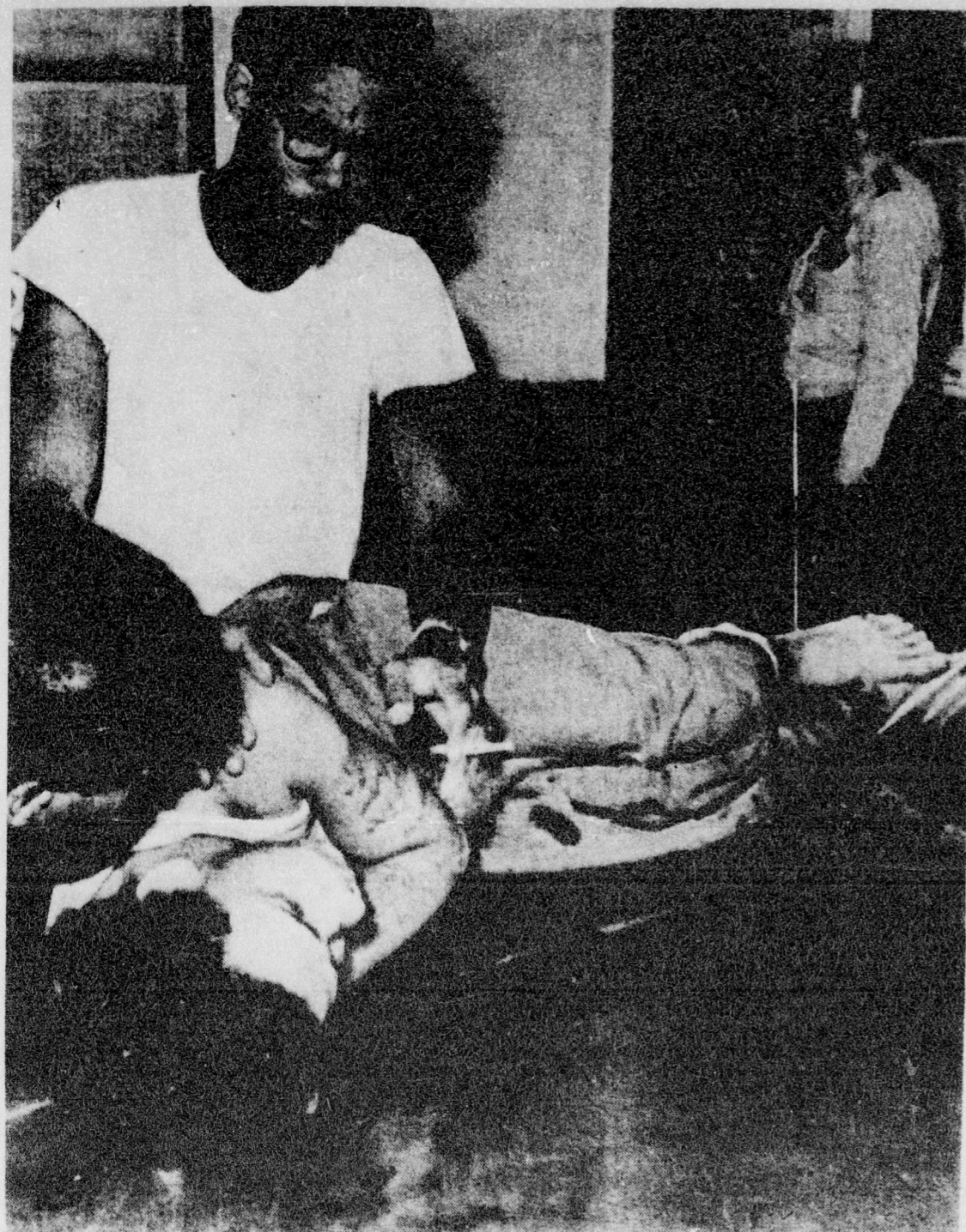
PEOPLE'S PARTY LEADER KILLED-Houston: Carl B. Hampton, leader of "People's Party II", lies fatally wounded after a shootout with police in front of his headquarters late July 26. Six other persons were injured in the incident and approx. 60 were jailed. (UPI).