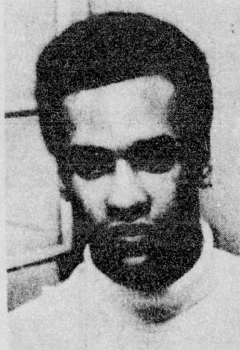
CLAIMS "AMERICA TRULY A PRISON"-San Luis Obispo, Calif.: Black Panther leader Huey P. Newton, who considers himself a prisoner of war in a continuing American revolution, "is going back to the front lines." Newton, 28, faces a bail hearing in Oakland, Calif., this week which will probably result in his being out on the streets for the first time in nearly three weeks. "But I will not really be out, because America is truly a prison," Newton said in a prison interview August 3.

The Business Participation Division serves as a focal point (See HUD NAMES, P. 2)