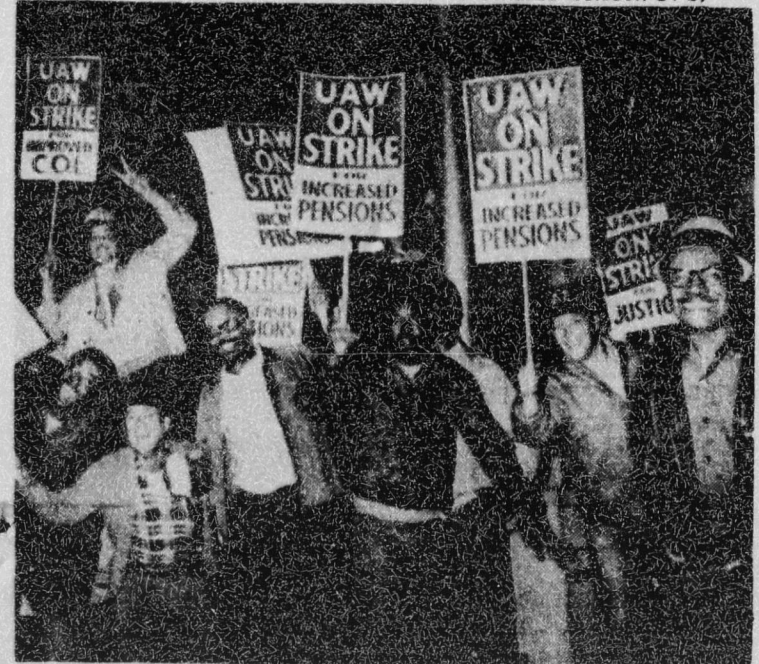
STRIKING WORKERS WAVE PICKET SIGNS-Detroit: General Motors workers wave picket signs outside a Detroit GM plant after the United Auto Workers struck giant General Motors at midnight Sept. 14