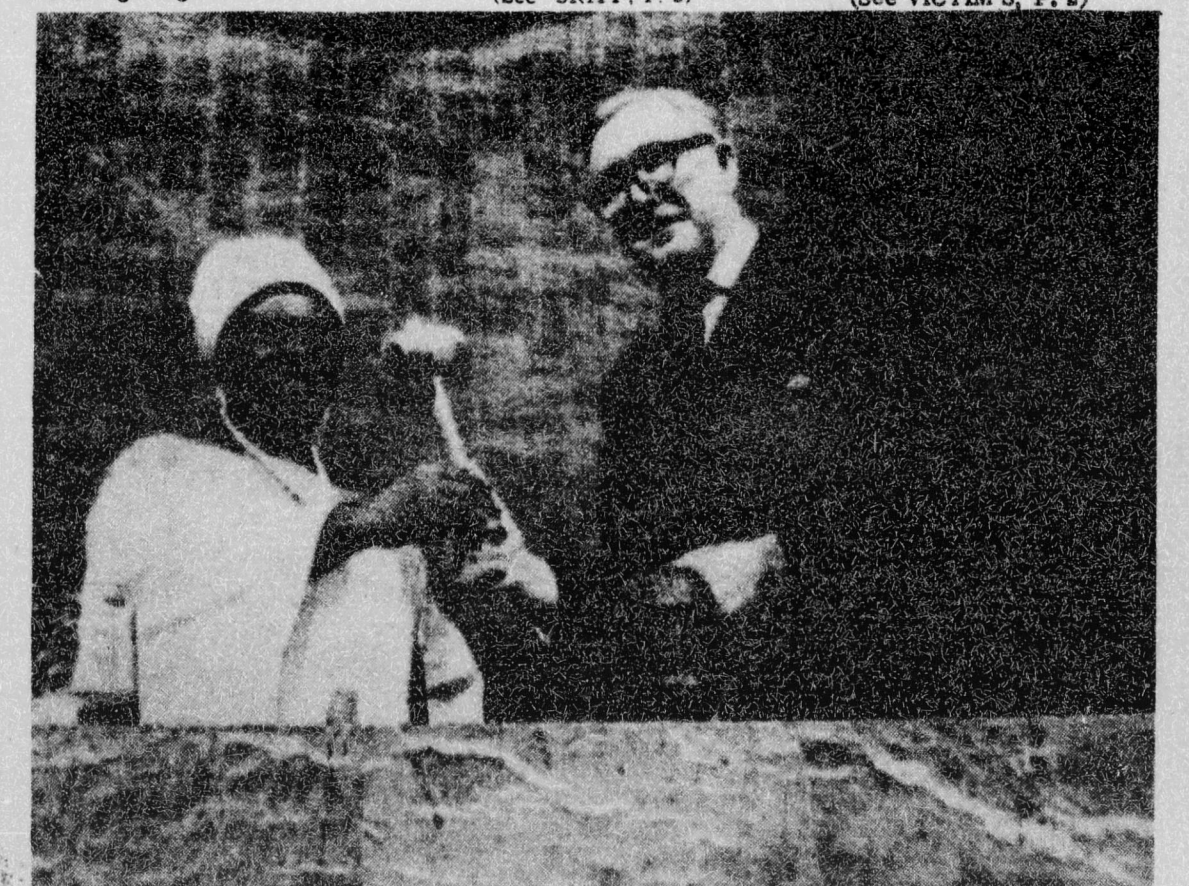
MISS BROOKS HANDS OVER GAVEL - United Nations, N. Y.: General Assembly President Edvard Hambro of Norway receives gavel from his predecessor, Miss Angie Brooks of Liberia, at the opening of the Assembly's 25th session Sept. 15

Billed as a "stomach wheels," the parade will feature integrated choirs from nearly 100 churches and religious institutions; and floats with wrestling exhibitions, presentations by the Philadelphia Lyric Opera Company and the Pennsylvania Ballet Company, and illustrations (See UNITY, P. 2)