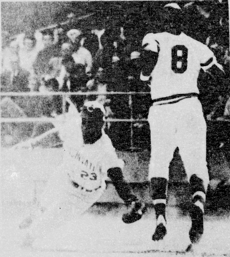
SAFE AT FIRST - Pittsburgh, Pa.: Pirates' Willie Stargel is safe at first in the 6th inning on his slow roller to Reds third baseman Tony Perez. Perez threw wildly to Lee May at first (note ball by arm).