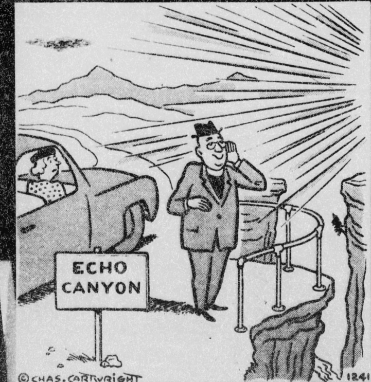
"The stock market will not affect church giving! ... the stock market will not affect ...!"

thrice, that it might depart from me. And He said unto me: My grace is sufficient for thee, for my strength is made perfect in weakness" (II Cor. 12:7-9).