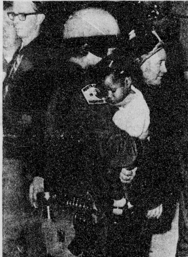
SHOW OF COMPASSION-Henderson: A North Carolina Highway Patrolman in a riot helmet carries a sleeping youngster, who was an occupant of a car stopped for curfew violation in Henderson, scene of disorder Nov. 6 night. The driver of the vehicle was booked Nov. 7 for driving under the influence of alcohol. Officers had to turn this child and three others from the same car over to a social worker for the evening.