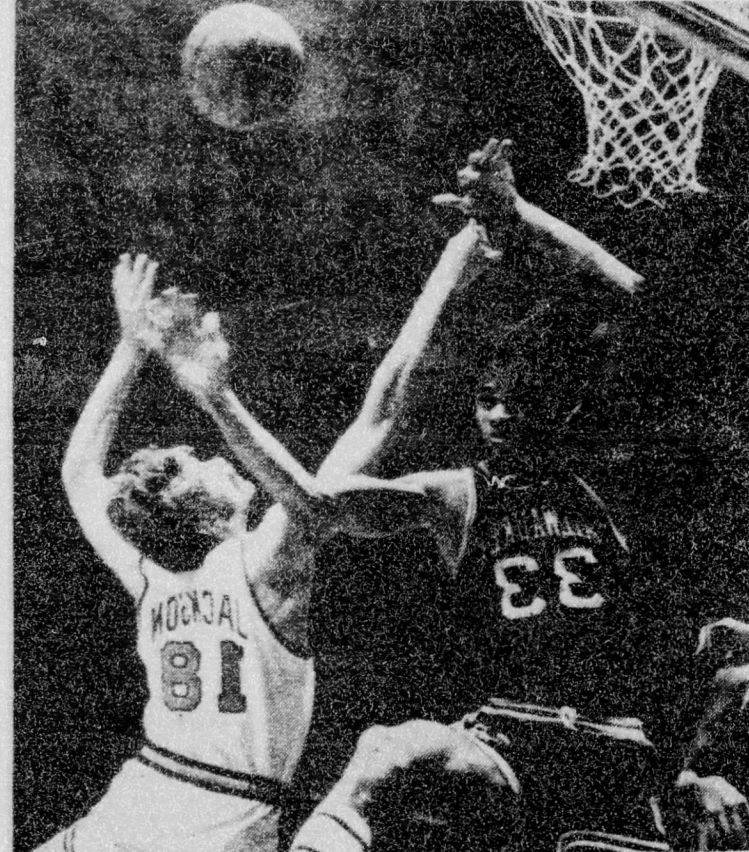
ALCINDOR FOULED -New York: New York Knicks' Phil Jackson (R) fouls Milwaukee Bucks' Lew Alcindor during the Milwaukee-New York game here Nov. 28. The Knicks won, 100-99.