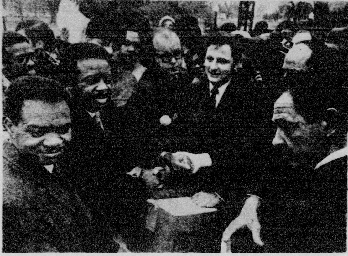
SEEK NATIONAL HOLIDAY FOR KING'S BIRTH DATE - Washington: Rev. Ralph Abernathy, 2nd from left, after arriving on Capitol Hill on a mule drawn wagon January 15, presents a petition "with millions of signatures" to Senator Birch Bayh, D-Ind. (center right), asking that January 15, Dr. Martin Luther King's birthday be made a national holiday. With Abernathy is Rev. Walter Fauntroy, former aide to King. With Bayh are Senator Adlai Stevenson III, D-Ill. (partly hidden at right), and Rep. William F. Ryan, D-N. Y. (right).