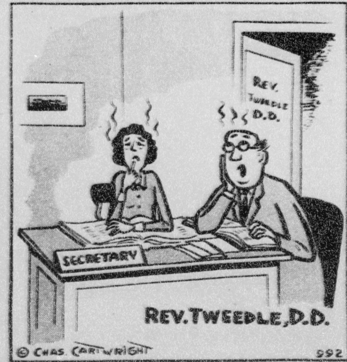
"All pledges paid up to date, record high attendance, perfect church staff, new members crowding in... now you've got ME worried, too!"