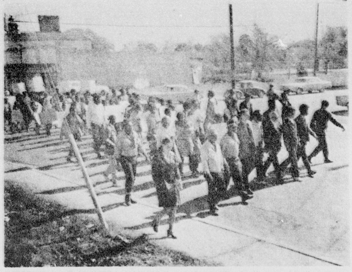
PROTEST CAPE KENNEDY LAUNCHING-Daytona Beach, Fla.: Small group of Southern Christian Leadership Conference members headed by Rev. Ralph D. Abernathy and ministers from this area as they left Stewart Memorial Church for a rally at Bethune Cookman Chapel in an attempted march to Cape Kennedy by Sunday just before the launch of Apollo 14. A mule train, the same one which carried Dr. Martin Luther King to his tomb, was to have been part of the march, but did not appear.