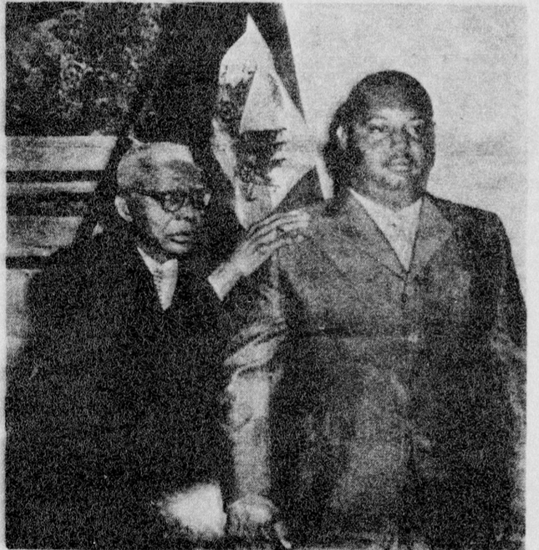
NAMES TEENAGE SON AS SUCCESSOR-Port Au Prince, Haiti: President-for-Life Francois Duvalier is shown embracing his 19-year-old son, Jean Claude (right) in this poster which appeared by the thousands on the streets of the Haitian capital Feb. 2, following Duvalier's selection of his son to replace him as President in the event the elderly dictator can no longer continue to rule. Foreign news photographers, including Dirk Halstead of UPI, who made this photo from a poster being brought back by a tourist, were refused entry to Port Au Prince Feb. 2.