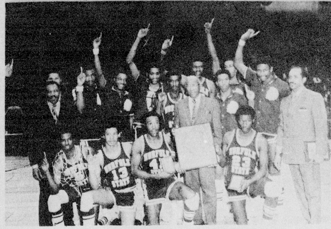
WE'RE NUMBER ONE-Members of the Norfolk State basketball team hold up one finger indicating they were number one in the CIAA. The Spartans defeated Shaw University, 74-68 in the finals of the tournament to win the conference tournament championship.