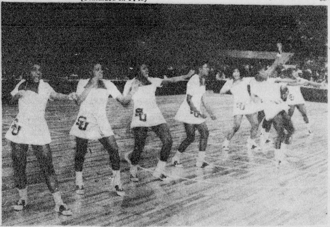
SOCK IT TO THEM-Shaw University cheerleaders give the 13,881 spectators something to look at during a timeout of the championship game of the 26th annual CIAA Tournament held in Greensboro. All during the tournament, the Shaw cheerleaders received loud rounds of applause from the fans for their outstanding performances.