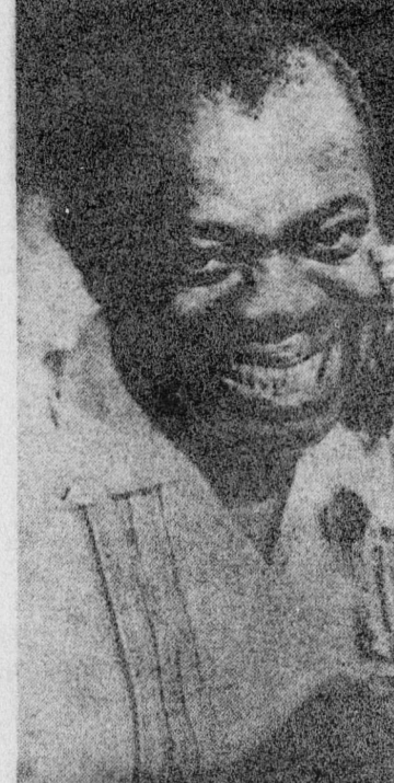
"SATCHMO" IMPROVING - New York: Doctors watching the condition of Jazz great Louis "Satchmo" Armstrong, see a "significant improvement" in his battle with heart trouble, it was learned April 4. Armstrong was first taken to the hospital March 15.