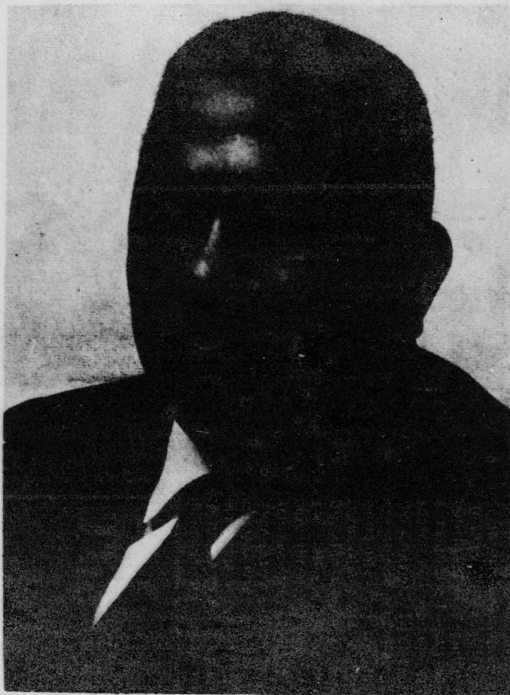
ECCLES LEE LEAK