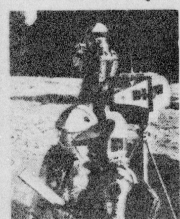
MGM presents a STANLEY KUBRICK PRODUCTION

"A fantastic movie about man's future!" Life Magazine