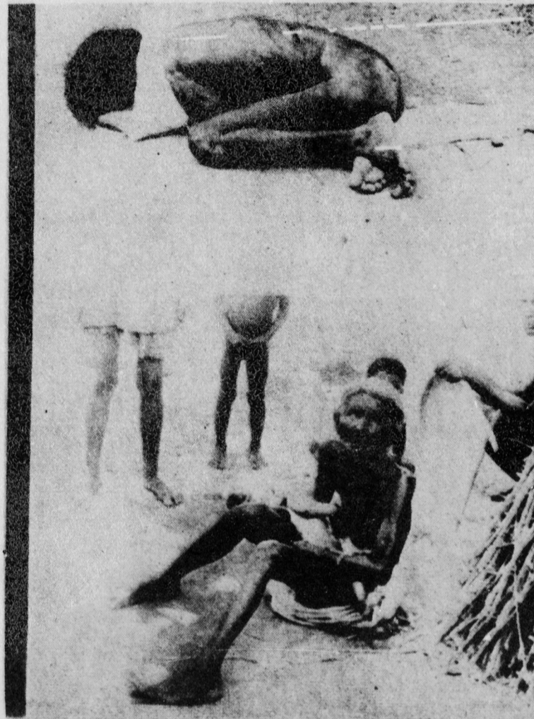
RAVAGES OF HUNGER, DISEASE - CALCUTTA: Suffering is very real in the West Bengal State where thousands of refugees from East Pakistan battle hunger and cholera in epidemic proportions. Indian officials continue to watch for further cases of cholera among the refugees in the Calcutta area. Reports from outlying areas continue to push the toll upward although the outbreak appeared to be on the decline in the hardest hit border areas.