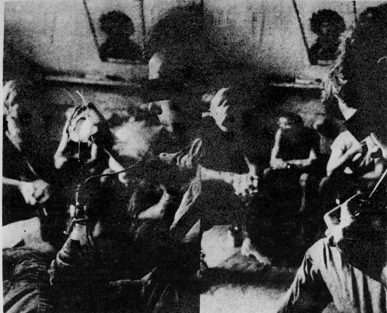
SOLDIERS GET HIGH IN VIETNAM - Quang Tri Province, S. Vietnam: To get at pushers operating outside bases, MPs send long-haired GIs in armored personnel carriers driving down highways, stopping periodically to try and buy drugs. If and when a pusher is found, the GIs radio a helicopter hovering over the horizon and it follows the pusher to his supply caches. The current drive is expected to last about 90 days. Necessity being the mother of invention, this imaginative GI

lights up a hooka made from a wine bottle and a.45 caliber shell in his living quarters here recently. To combat the high incidents of returning drug users, the U. S. Military Command has instituted a series of pre-departure checks, with GIs undergoing detection tests by FRAT (Free Radical Analysis Technique), which determines if a person is on heroin, major target of the current drive. Here, a GI lights up marijuana cigarette in living quarters as his buddies sit around in a relaxed state.