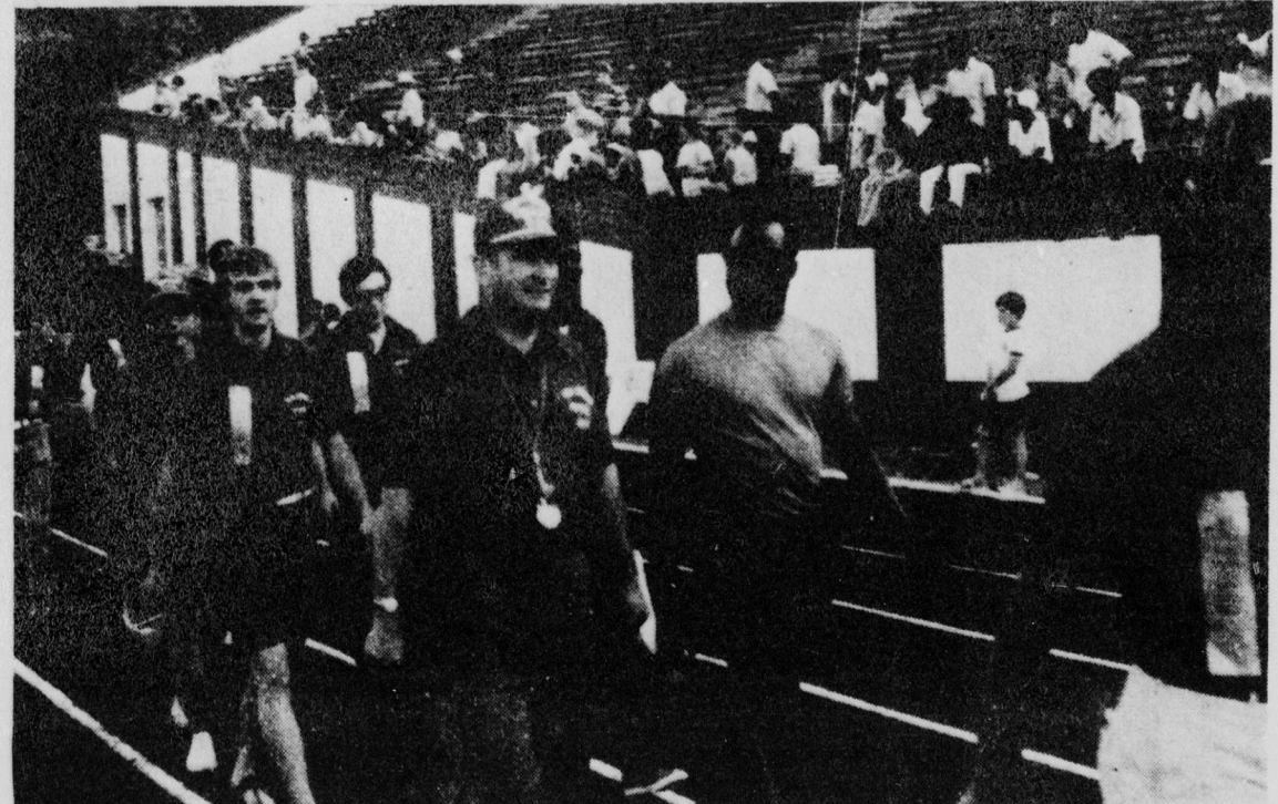
CEREMONIES - The Pan Africa-USA International Track Meet would not have been complete without opening and closing ceremonies. Top photo, the African team, led by captain Kip Keino, began their march to the middle of the field during the opening ceremonies. Keino and his other teammates along with African officials stand at attention while the national anthem is played in center photo. In the bottom photo, the officials for the African and the United States teams began their march around the track in the closing ceremonies climaxing the Meet.