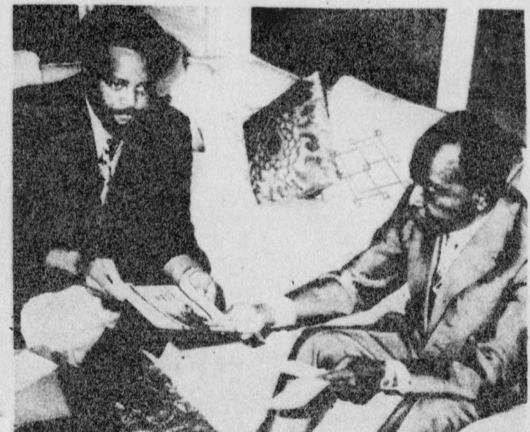
SCLC, AFRICAN LEADERS MEET - Abidjan, Ivory Coast-Hosea L. Williams, left, program director for SCLC, met with Ivory Coast President Felix Houphouet-Boigny, right, to discuss Black solidarity. President Houphouet-Boigny, accepts William's SCLC report on the Poor People's Campaign and a film on Dr. Martin Luther King, Jr.'s life.