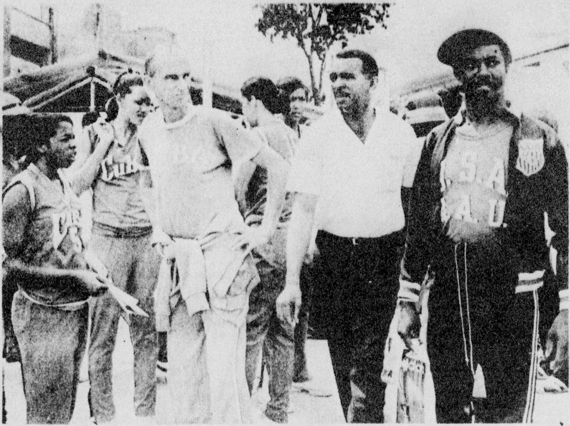
SCRUTINIZE TRACK STAR - Colombia: Members of the Cuban Pan American Games team eye Jim Green, U. S. sprint star, as he passes them during a stroll around the Pan American Village July 27. The American team arrived late July 26.