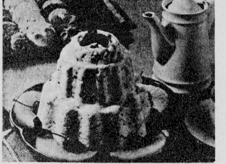
PINEAPPLE WHIP DESSERT (Makes 6 to 8 servings)

Pineapple Whip Dessert helps to cool these warm and balmy Indian Summer days. The velvetized evaporated milk is chilled, whipped, then mixed with a spicy gelatin mixture. The result is a lighter, smoother, more delicate flavor and texture; the kind you would want on a warm fall night.