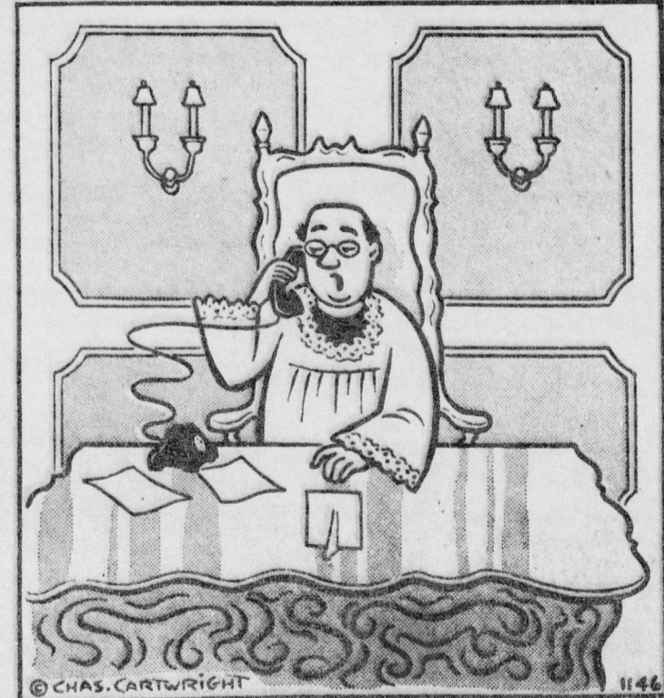
"No, this isn't Joe's Bar and Grill."