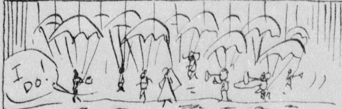
The first parachute wedding was performed in 1940 at the New York World's Fair. The minister, the bride and groom, the best man, the maid of honor, and four musicians were all suspended in parachutes!