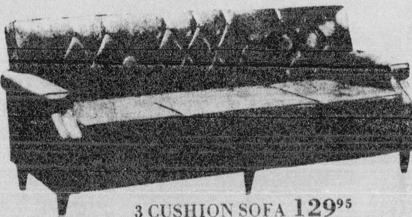
3 CUSHION SOFA 129 95