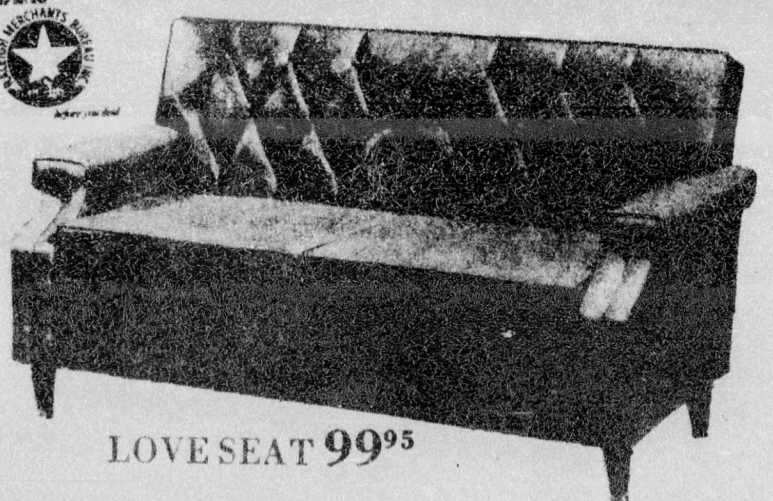
LOVE SEAT 99 95