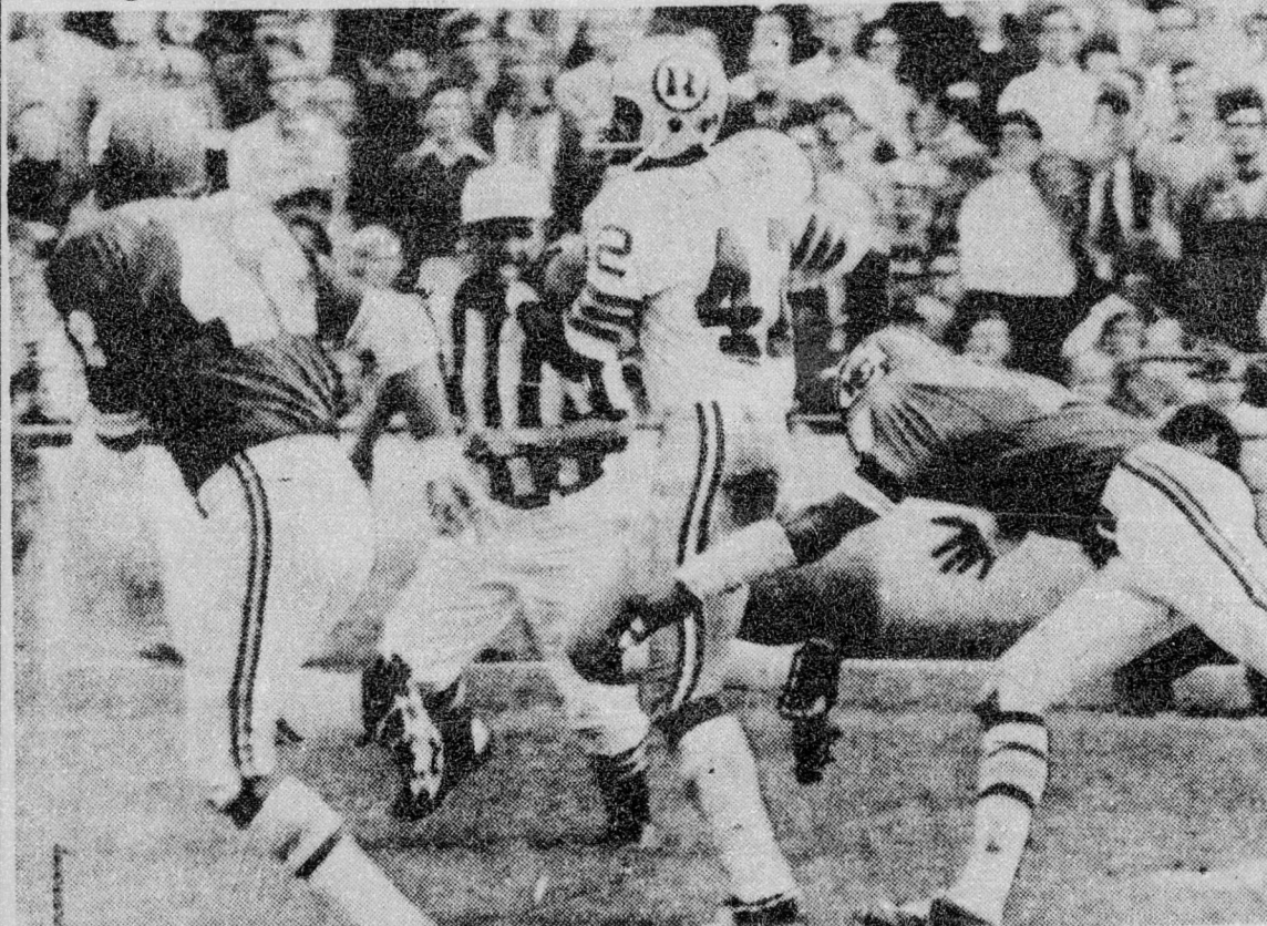
CHARLEY TAYLOR HEADS FOR PAYDIRT - Kansas City, Mo.: Washington's Charley Taylor (42) heads for a TD in the 2nd quarter as he is pursued by Chiefs' Johnny Robinson (42) and Emmitt Thomas (18). The play covered 35 yards. Taylor was brought down on the goal line by Thomas. The TD made it 17-6 in favor of the Redskins.