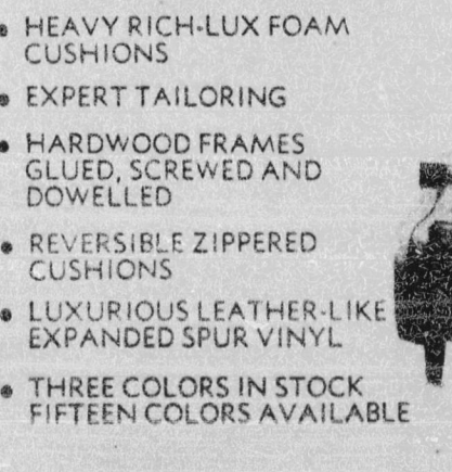
SOFA BED 119 95