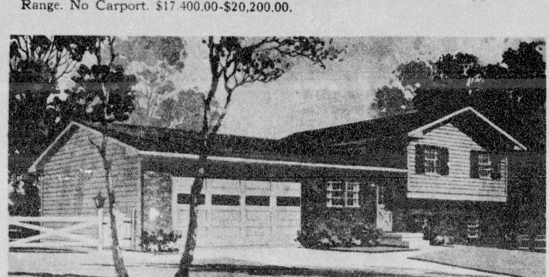
CRESTBROOKE - Split Level, 3 Bedrooms. No Carport. Downstairs